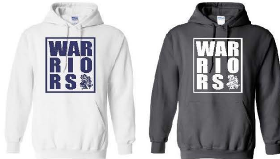
White with navy letters Charcoal with white letters

Please write quantity needed in the appropriate box. (Shades of pink may vary based on company inventory.)