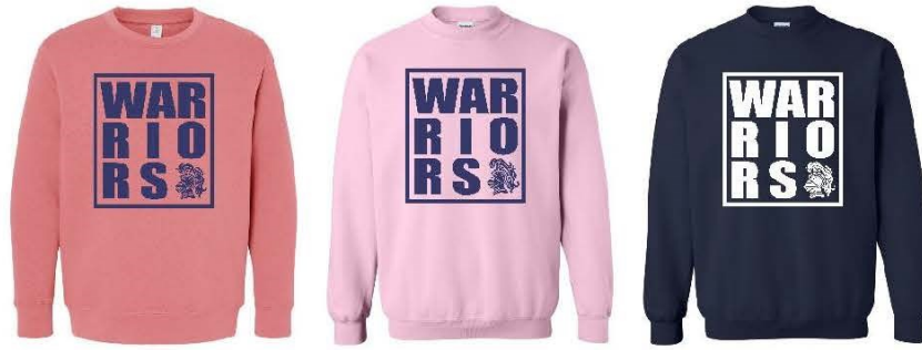
Mauve with navy letters (Youth sizes ONLY) Light pink with navy letters (Adult sizes ONLY) Navy with white letters